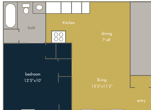
1 bd, 1 bath / 541 Sq. Ft rent — deposit —