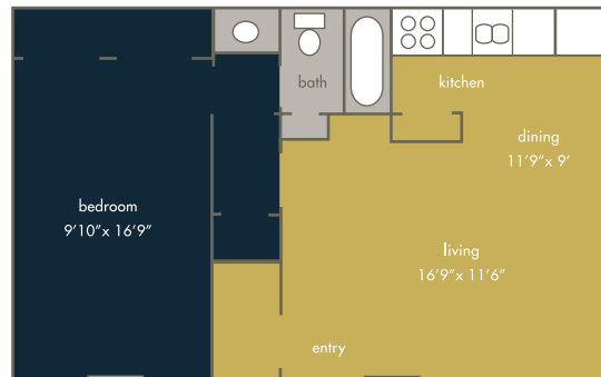
1 bd, 1 bath / 595 Sq. Ft rent — deposit —