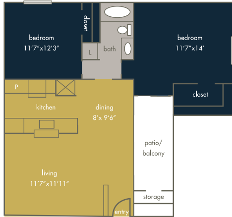
2 bd, 1 bath / 904 Sq. Ft rent — deposit —