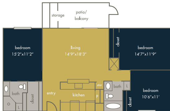
3 bd, 2 bath / 1152 Sq. Ft rent — deposit —

ACG is a San Antonio 501(c)(3) non-profit affordable housing provider whose mission is to develop, acquire, own and manage leased affordable housing in a community environment that promotes resident education, self-sufficiency, leadership and volunteerism through successful partnerships. ACG is a chartered member of NeighborWorks® America, a national network of more than 240 community development and affordable housing organizations.